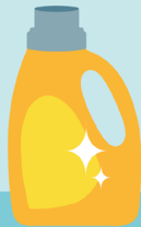
LIQUID LAUNDRY DETERGENT